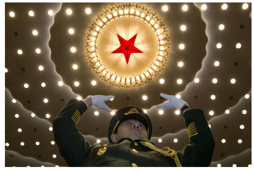
A military band conductor during the opening session of the National People's Congress on Thursday at the Great Hall of the People in Beijing.

Consider five telling indications of the regime's vulnerability and the party's systemic weaknesses.