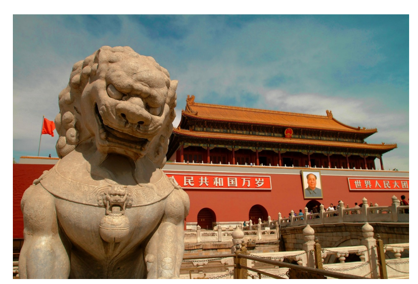
The Gate of Heavenly Peace in Beijing's Tiananmen Square, the site of pro-democracy demonstrations in 1989.

Predicting the demise of authoritarian regimes is a risky business. Few Western experts forecast the collapse of the Soviet Union before it occurred in 1991; the CIA missed it entirely. The downfall of Eastern Europe's communist states two years earlier was similarly scorned as the wishful thinking of anticommunists—until it happened. The post-Soviet "color revolutions" in Georgia, Ukraine and Kyrgyzstan from 2003 to 2005, as well as the 2011 Arab Spring uprisings, all burst forth unanticipated.