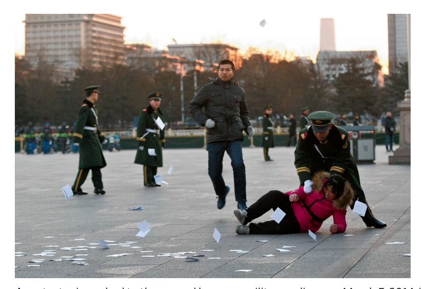
A protester is pushed to the ground by a paramilitary policeman March 5, 2014, in Beijing before the opening of the National People's Congress nearby.

A more secure and confident government would not institute such a severe crackdown. It is a symptom of the party leadership's deep anxiety and insecurity.