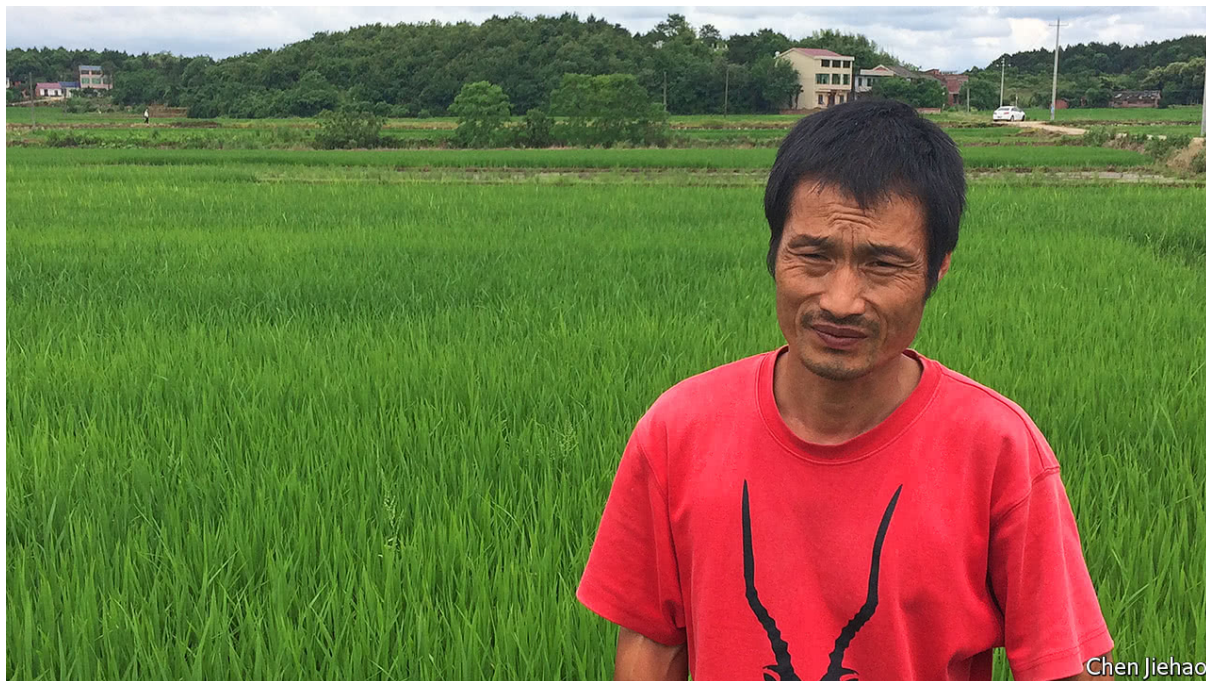
Mr Tang calls for assistance

The Chinese have experimented with growing willow trees, which absorb cadmium, and poplars, which do the same for lead, to clean up its fields. This works—but the fields cannot be used for crops in the meantime. Typically the treatment of poisoned brownfields consists of spreading layers of clay or concrete over the affected areas, as happened in Changzhou, but this often just pollutes the water table beneath. Gao Shengda, the secretary of the China Environmental Remediation Industry Association, admits that the country lacks the experience and technical skills to stabilise its polluted soils.