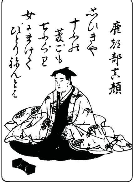
The kyōka poets Akera Kankō, Yomono Akara, Yadoya no Meshimori, and Shikatsube Magao. From Azumaburi kyōka bunko (A Collection of Eastern-Style Kyōka ). Drawings by Santō Kyōden, published in 1786. (In the possession of the Tokyo Metropolitan Central Library.)