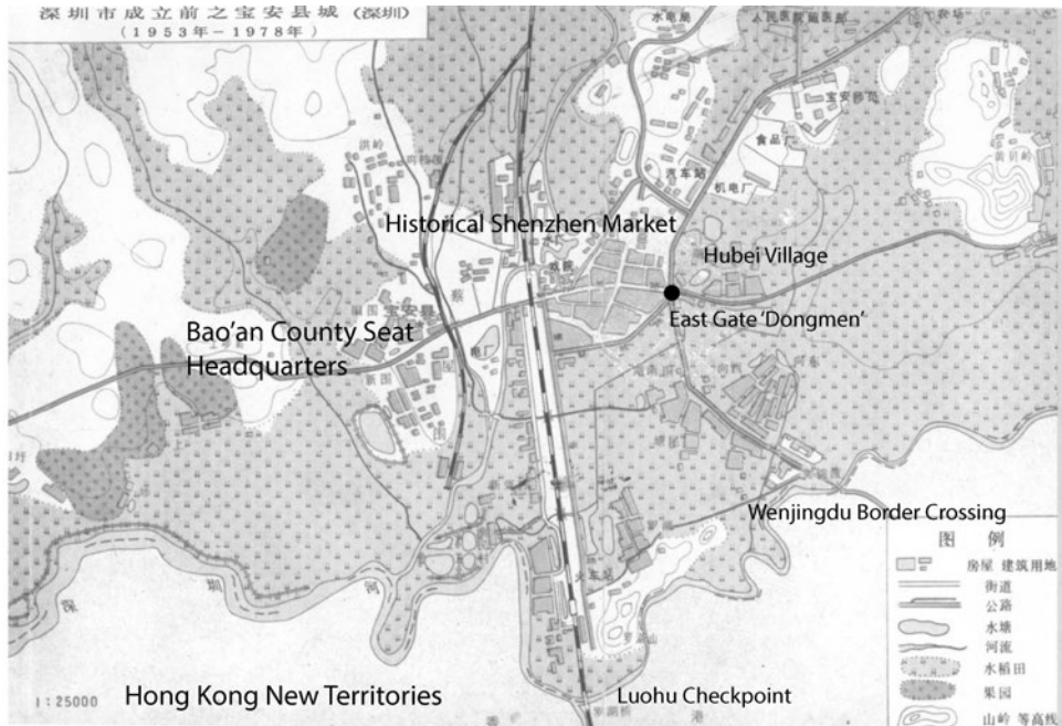
Figure 36.1 The “Map of Bao’an County Seat before the Establishment of Shenzhen City, 1953–1978” shows the location of the key sites that comprised “the Special Zone” during the 1980s and into the new millennium.