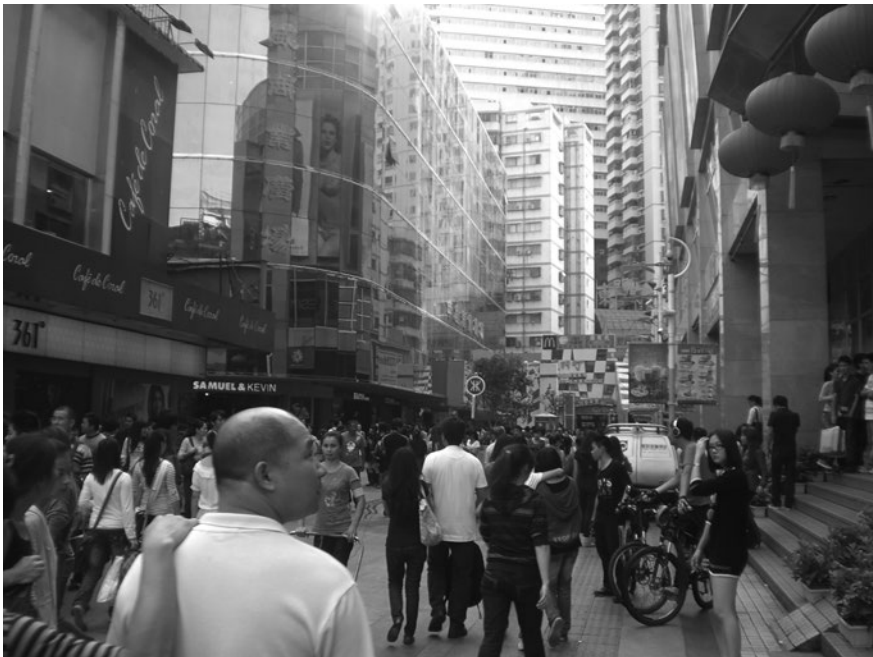
Figure 36.3 Dongmen Pedestrian Street, 2010, one of Shenzhen's most popular tourist destinations.