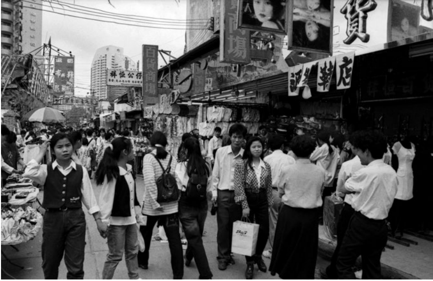
Figure 36.2 Historical Shenzhen Market, circa 1990. This photograph hints at the original layout of market streets as well as the pace of urbanization.