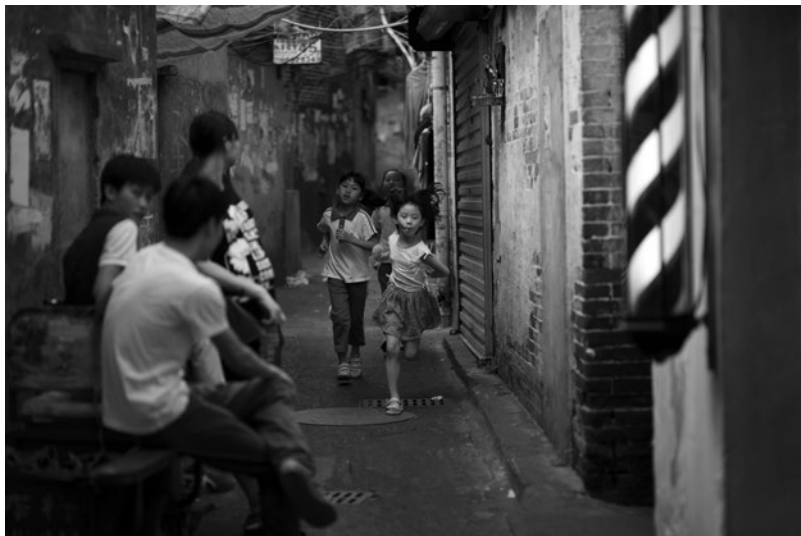
Figure 36.6 Everyday life in Old Hubei – children playing in an alleyway.